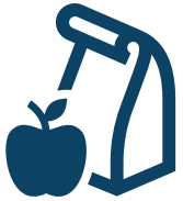
MCH Public Health