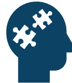
Mental Health Professionals