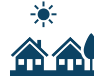
Community Advocacy Organizations